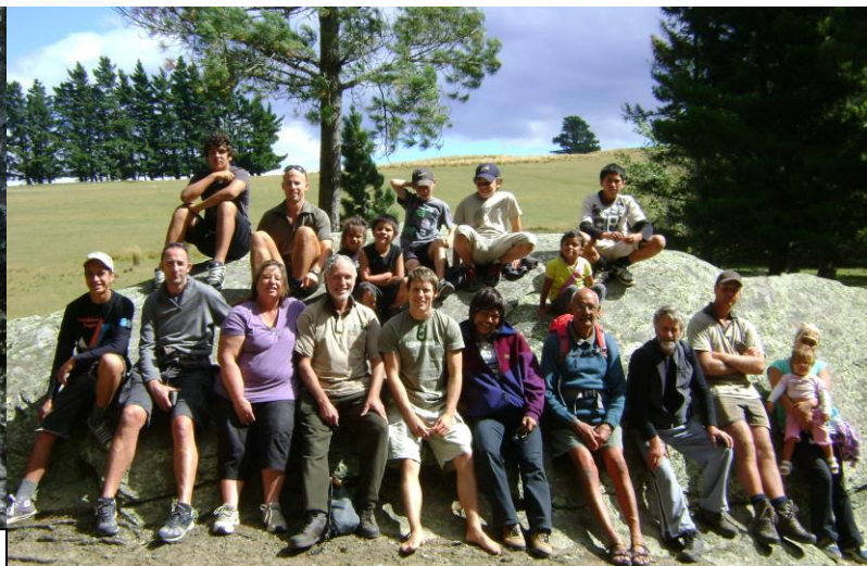
Visiting the skinks at Macraes – Saturday 7 th March 2009.